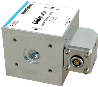
ORC-Micro Standard (Viewport)